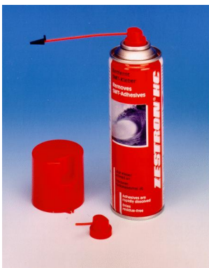
ZESTRON® HC aerosol can

Please refer to the material compatibility list (Technical information 3) before cleaning plastics.