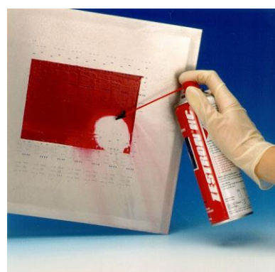
Cleaning of adhesives on stencils with ZESTRON® HC